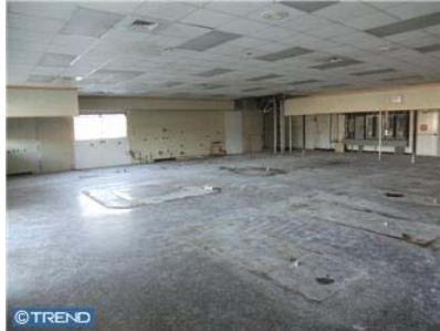
Interior View 2