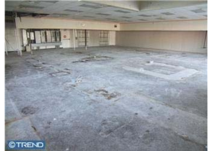
Interior View 2