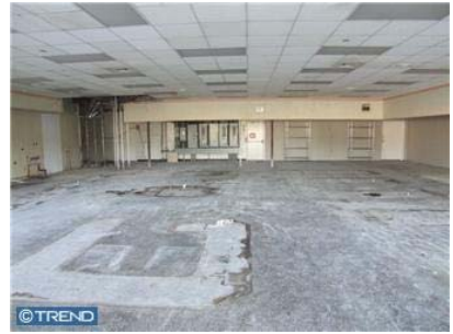
Interior View 1