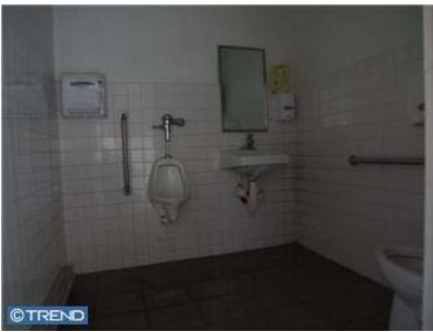
Interior View 2

© Copyright 2010 TREND - All information, regardless of source, including square footages and lot sizes, should be verified by personal inspection by and/or with the appropriate professional(s). The information is not guaranteed. Created: 01/28/10 09:34 PM.